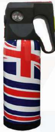
Ceasefire Union Jack